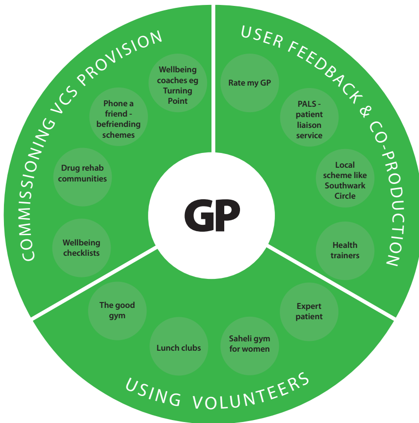
Figure one : A hypothetical civil society network to support a GP